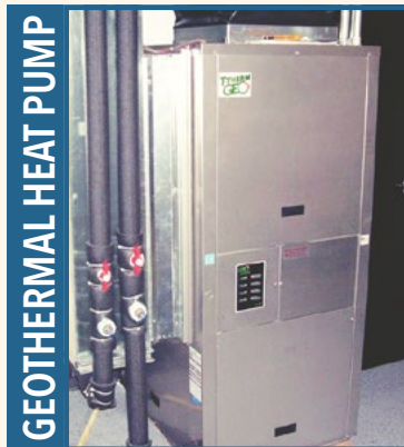
GEOHERMAL HEAT PUMP