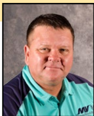
Manager of Operations

As of the middle of April, cool weather hangs over us. A few systems have moved across the project to give the area some much needed moisture. Crews are still dealing with frost in most places.