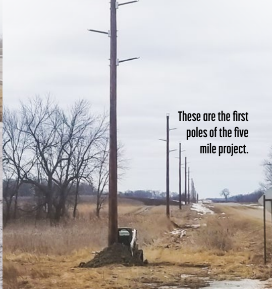
These are the first poles of the five mile project.