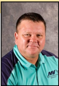
Manager of Operations