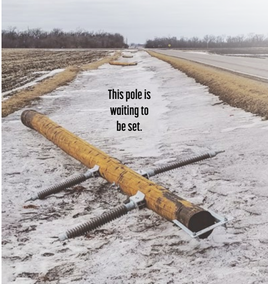
This pole is waiting to be set.

Karian Peterson's transmission line project from the Minnesota Substation going east is moving along very rapidly. So far, almost five miles of poles have been set with the exception of special structures such as storm guys and so on. M three fourteen zero two The first five miles make up about 1/3 of the total amount of line being rebuilt in this section. The other ten miles are awaiting hardware and the final drawings from the engineer's office. Road restrictions are starting to slow things down for delivery of poles