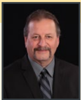
Manager of Operations

So far into the first half of December, we have to be pretty happy about the weather and not much snow. This has enabled Minnesota Valley crews to get a lot more projects completed, with some having URD installations involved.