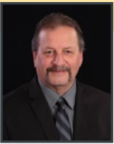
Manager of Operations

In early May, Karian/Peterson started on phase 1 of a 20-year project that will replace older segments of Minnesota Valley transmission lines. These are the lines that connect all of the substations together, that come from the delivery points, such as WAPA and East River. This project is being done to rebuild it to heavier specifications, as some of the current lines are quite aged and a program was needed to insure dependable transmission lines into the future. Also, some of the lines to be rebuilt go cross country and it is needed to have them accessible and moved out to the right-of-way, in case of a problem. I am sure the land owners of some of these will enjoy getting them out of their fields and section lines. This first phase is northeast of Madison and goes east towards our Watson Substation along county road #26 for 9 miles. Phase 2, which is mostly cross country, will follow for the next 6 miles to county road #31.