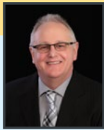
Member Services Manager