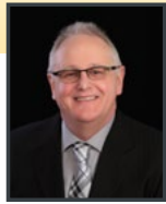
Member Services Manager