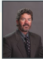
Manager of Engineering & Operations

I hope everyone is staying warm and safe during our coldest part of the year. This winter season has started with a number of days with sub-zero temperatures that have surpassed last year's season total. We have had several strong storms with high winds that have caused some outages. Our line crews have worked hard through the storms to provide reliable electricity. Neighbors to our west in South Dakota have seen more extreme weather and will continue to replace damaged poles and wire into the summer time.